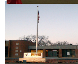
Grand Junction Masonic Center

First line signer incentive program. Three petitions in a calendar year will pay your membership for a year. If you are a life member then it entitles you to receive stated meeting dinners for a year.