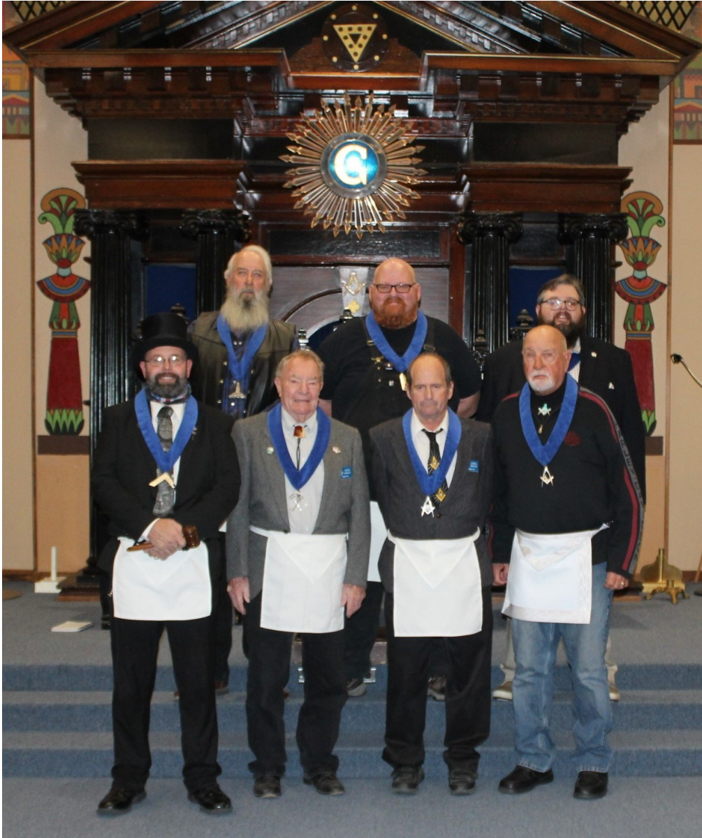
Palisade Lodge 125 A.F.&A.M 2021 Officers