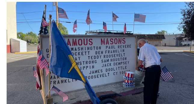
Parade entry from Palisade Lodge