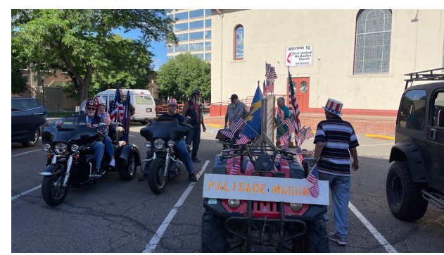
Parade entry from Palisade Lodge & Widows Sons