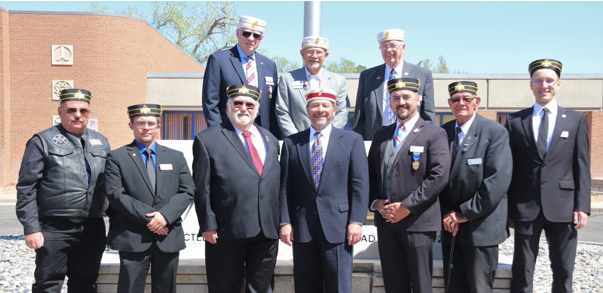
Grand Junction Consistory Class of 2022