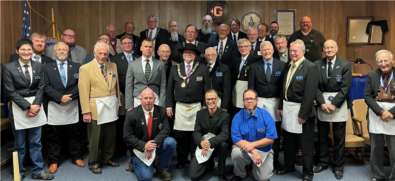
The Past Masters and MW GM (Above), and all Masons present (below)